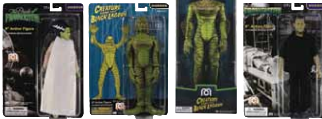
Megalo Horror Figures (Other Goodies)