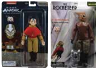
Megalo Figures (Other Goodies)

Some more items that did not quite fit into the catalog. Find these and any other catalog listings at: WESTFIELDCOMICS.COM/SECTION/CATALOG-AUG21